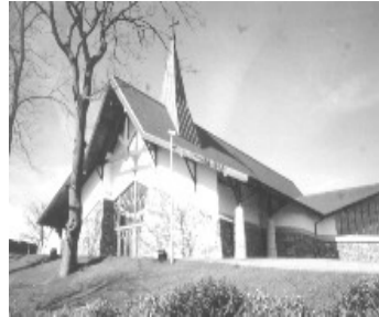
Saint Nicholas' Church