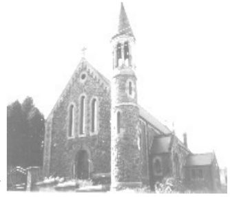
Our Lady of Lourdes Church