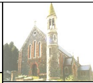
Our Lady of Lourdes