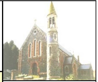
Our Lady of Lourdes