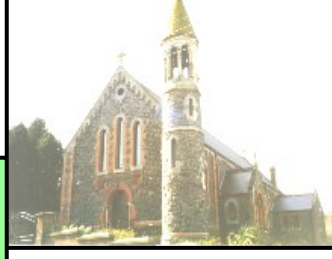
Our Lady of Lourdes

Follow us on-line at www.carrickparish.org