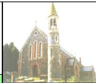
Our Lady of Lourdes